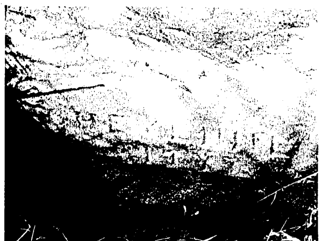
Figure 2 - "CHEYENNE CITY" on south face.

RECORDED 4/17/2013 AT 1:47 PM REC# 613517 BK# 2332 PG# 176 DEBRA K. LATHROP, CLERK OF LARAMIE COUNTY, WY PAGE 3 OF 3