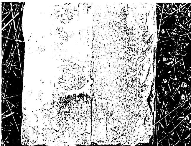
Figure 1 - "X" for reset position.